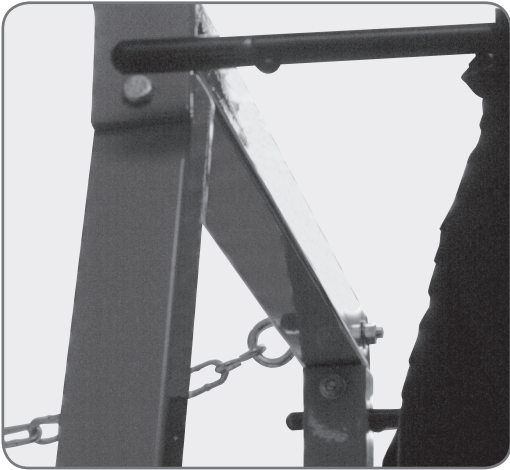
Step 1 Insert one arm of the ball bag frame into the appropriate holes on the frame.