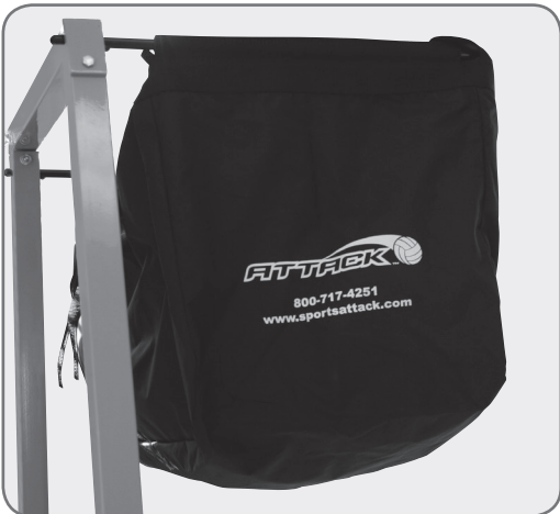
Step 5 Both arms are securely in place.