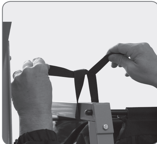
Step 6 Tie ball bag straps.