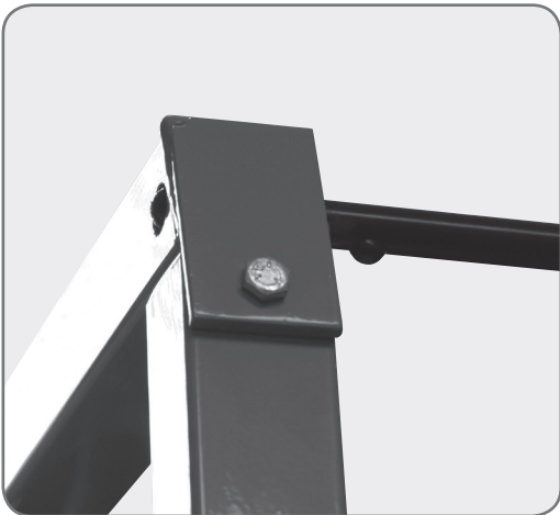
Step 3 Insert arm into the holes on the platform frame.